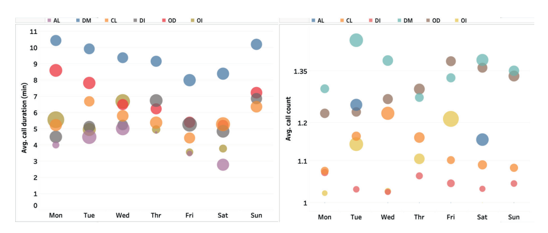
Figure 3. Bubble charts of average (a) call duration (min) (left) and (b) call count (right) across various on-campus POIs during different days of a week

In the evening, the second highest call duration comes from outdoor POIs (ODs). We observe that, during the night, the average call duration becomes maximum. The ODs are always the second dominant group in terms of average call duration and count, and we observe a steady pattern across all epochs. In Figure 2, we observe that evening epochs at DMs achieve the highest average call count. In the figure, we further observe that students make shorter and more frequent calls in the evenings while making longer and less regular calls at nights, particularly in DMs. Additionally, the standard deviation is higher at night, which shows that call duration varies significantly across individuals during this epoch.